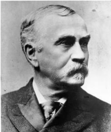
J Morton Sterling, Nebraska Territory Newspaper Editor

Most everyone has heard the story of J. Sterling Morton in Nebraska who in the mid