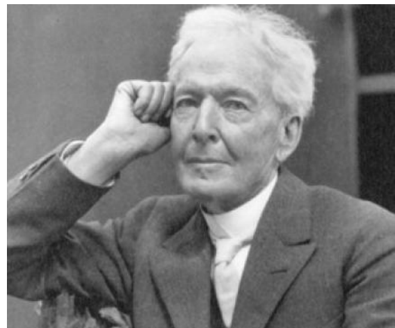
Luther Burbank, 1849-1926

But his greatest success was the Russet potato (1871), better known as the 'Idaho potato.' It was soon exported to help Ireland recover from the potato blight devastation of 1840-1860. And even today, Burbank's large, hardy, fine-grained potato is unsurpassed as a staple of American agriculture.