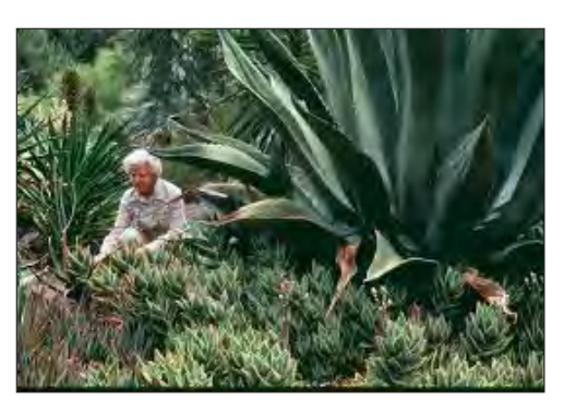
The Legacy of Ruth Bancroft: "I never met a plant too big or too mean for me."