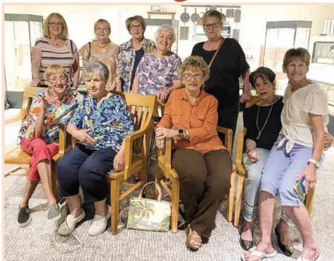
The Wild Flowers Budding Gardeners Group toured the McHenry Museum on June 24th. It was so informative and some of the girls had never been there. We then had lunch at Fuzios Restaurant.