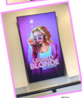
Out of Town Fair