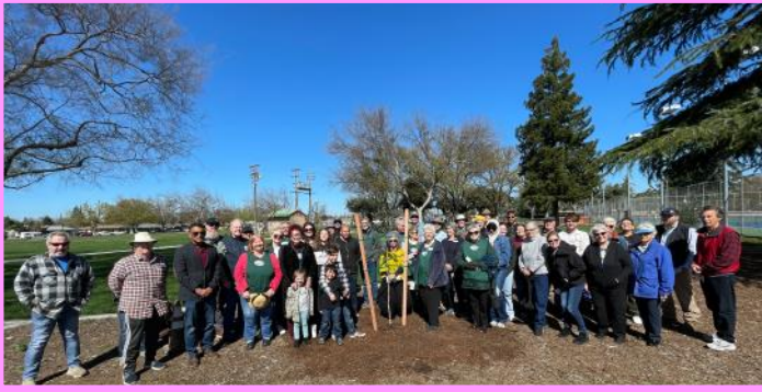
Arbor Day Celebration