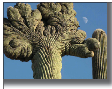
Saguaro Cactus: Example of Fasciation

New words, new facts, oddities and marvels.....Join us for a bit of delight.